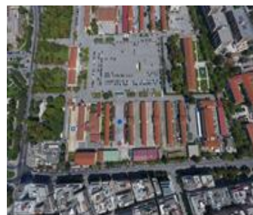
TOP VIEW OF THE CAMP