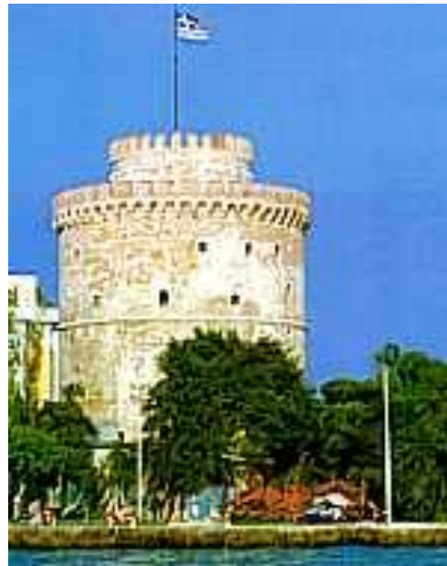
THE WHITE TOWER

a. The ancient King of Macedonia, Kassandros, married the stepsister of Alexander the Great, Thessaloniki, and named the city after her, uniting 26 small settlements that pre - existed around Thermaikos Gulf. The archaeological monuments of the city are an indisputable proof of the brilliant and glorious past of Hellenism extending back to about 2.500 years. Thessaloniki became an important gateway of the Roman Empire, an early springboard for the expansion of Christianity in Europe and a vital centre of the Byzantine Empire. Hellenic Army units liberated Thessaloniki and the wider Macedonia region from the Ottoman Empire domination during the Balkan Wars of 1912 - 1913.