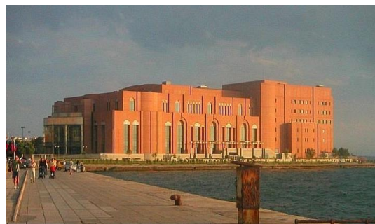
THE CONCERT HALL

Cultural life in Thessaloniki is very rich. A variety of cultural events organized by a number of cultural institutions and the Municipality of Thessaloniki are keeping the Galleries and the Theatres crowded all year round. It is worth mentioning the Cinema, Book and Song festivals, the International Film festival and “Dimitria” - a big festival of musical and theatrical events.