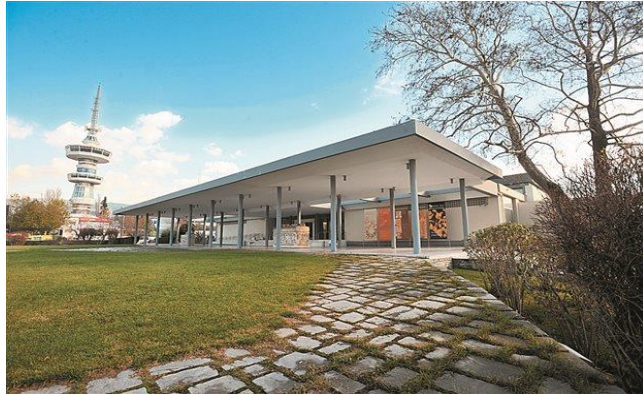
THE ARCHEOLOGICAL MUSEUM

Thessaloniki with its famous museums revives its very rich and multi - coloured past in a charming manner. These museums are the Archaeological Museum with exhibits from pre - historic, classic and roman times, the Museum of Byzantine Culture, the White Tower Museum, the War Museum, the Folkloric and Ethnologic Museum, the Museum of Ancient Greek Byzantine Instruments, the Museum of Macedonian Struggle, the Municipal Art and the Gallery of Macedonian Studies, the Museum of Cinema and the Museum of Photography that organize events and exhibitions on topics relevant to the content of their activities.